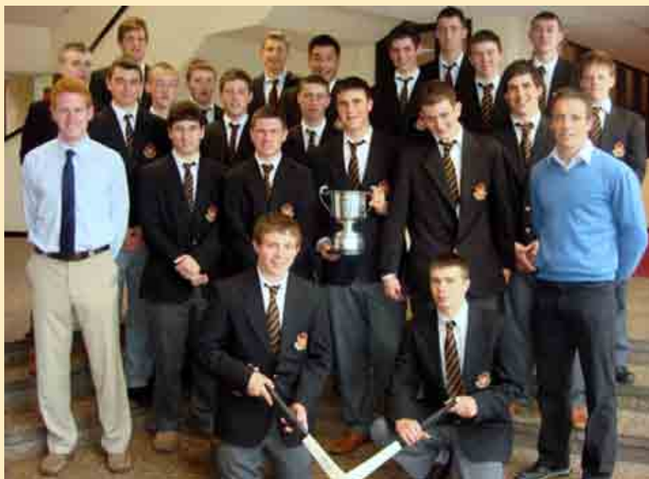
Lord Mayor's Hurling Cup Win

The highlight of the year was the Irish Schools Championships, held in Inniscarra. The school won the Men's Junior -16 Schull and the Men's Junior-16 double Schull.