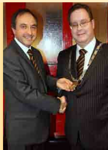
Handover of Chain

Photographed at their annual lunch in Waters Edge, Cobh on 25 May 2010, the class of 1951 look forward to celebrating their sixtieth year out in 2011