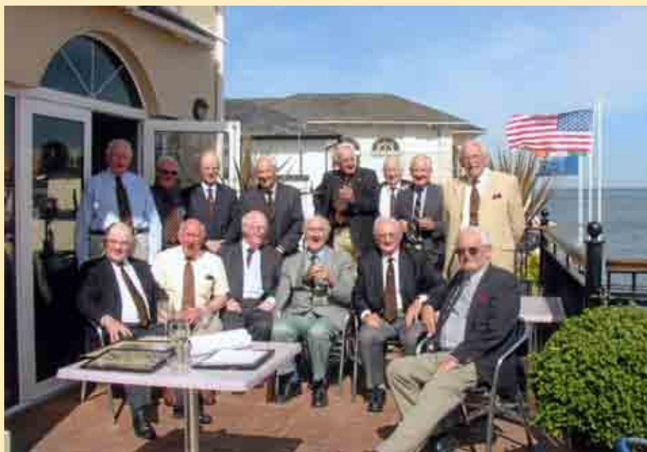
The Class of 1951

Photographed at their annual lunch in Waters Edge, Cobh on 25 May 2010, the class of 1951 look forward to celebrating their sixtieth year out in 2011