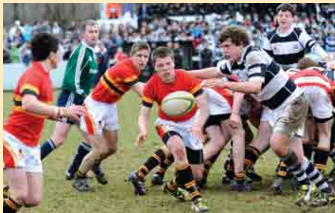
Junior Cup campaign action against Pres at Temple Hill, a game which CBC won with a score of 31 points to 10.

T eams from Christian Brothers College competed enthusiastically for rugby glory at all levels this year. They reached several finals, notably the Junior Cup final after a very gruelling campaign. Unfortunately, the teams brought no silverware back to CBC.