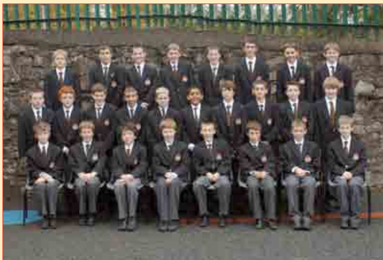
Absent: Donagh Buckley (Whitechurch).