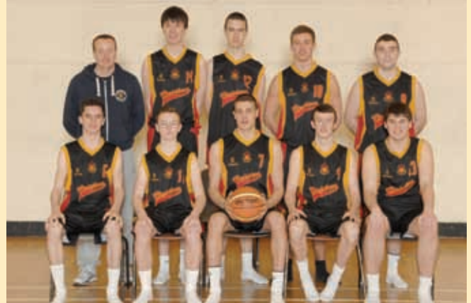
SENIOR BASKETBALL TEAM 2013-14

It was nice to finish the year with a trophy, but also in the knowledge that CBC can now compete at the top level in hurling.