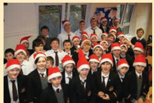
BELOW: THE 'SHINE IRELAND' SANTA HATS INITIATIVE WENT DOWN

The following are some of the charities supported this year: Marymount Hospice, the Simon Community, the Society of St Vincent de Paul, Jack & Jill Foundation, Cork Down Syndrome, Zambia Immersion Project, Shine Ireland, Hope Foundation, Live Life Foundation, Edith Wilkins Foundation, Cork Association of Autism, and the Guide Dogs.