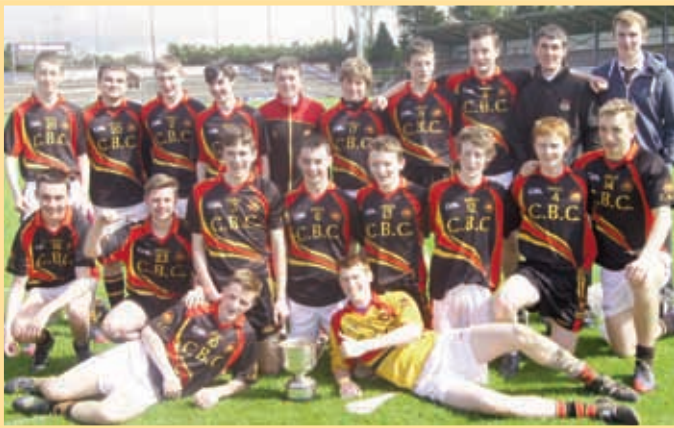
THE VICTORIOUS LORD MAYOR'S CUP HURLING TEAM