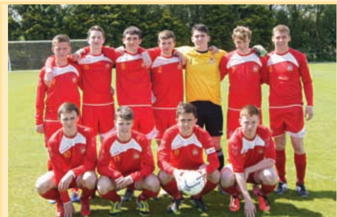
STARTING 11 IN THE FINAL AGAINST PBC

The run of successes in the Cork Cup was repeated in the Munster Junior Cup for the Under-17 soccer squad. Colaiste Choilm, Mitchelstown, Rochestown, Charleville and Comeragh College were all defeated without conceding a single goal. In the final, de la Salle, Waterford got the better of them, with the final score standing at 2 : nil.